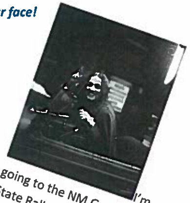
Going to the NM Good Sam State Rally!

Rt. 66 RV Resort 14500 Central Ave. SW Albuquerque, NM